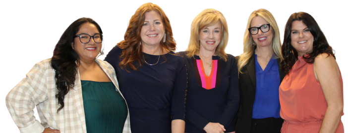
Sip N' Chat - Women's History Month: 03/27/24

Leadership guidance is invaluable, especially for those stepping into supervisory roles. Panelists emphasized the importance of skills such as active listening, ongoing education, and the ability to adapt to changing circumstances. These principles provide a roadmap for emerging women in leadership. The mentor-mentee relationship is highlighted as a cornerstone for growth, offering skill enhancement, learning from seasoned professionals, and opening doors to advancement opportunities.