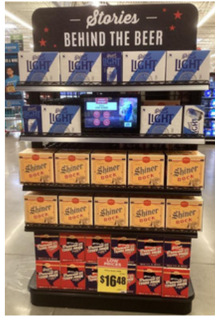
HEB FOOD 717 | ODESSA