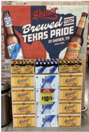
HEB FOOD 775 | SAN ANTONIO