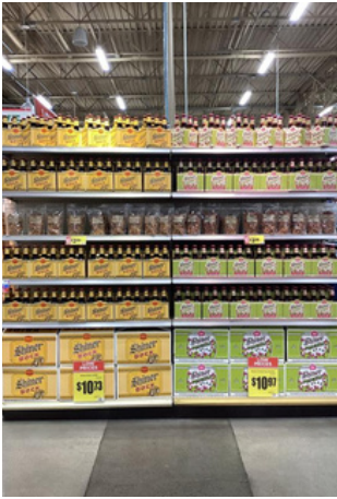
HEB FOOD 108 | SAN ANTONIO