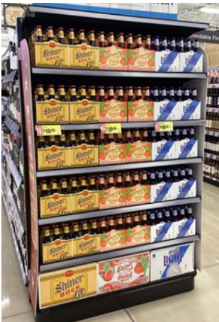
HEB FOOD 793 | SAN ANTONIO