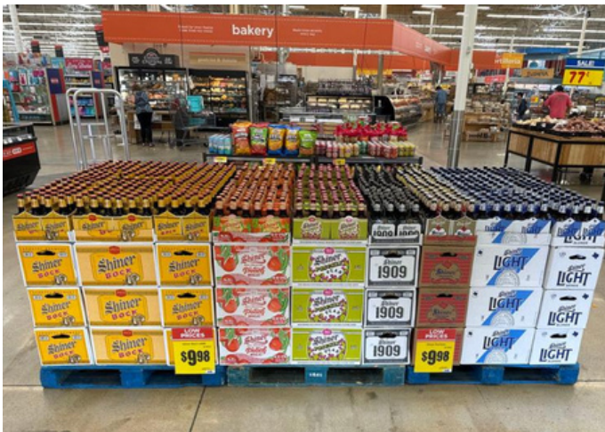
HEB FOOD STORE #092 | VICTORIA