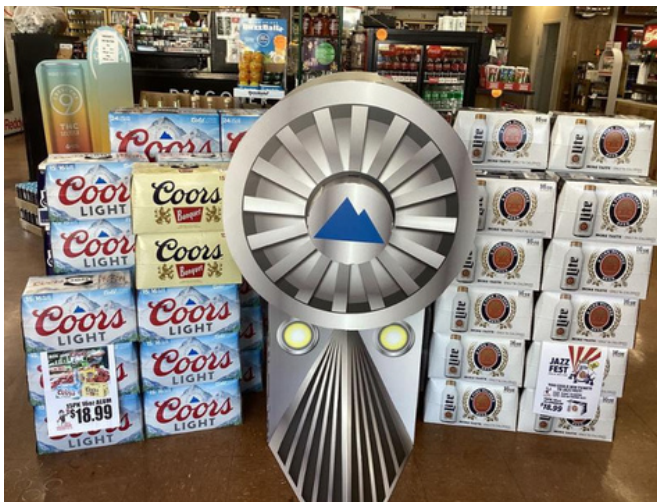
THRIFTY LIQUOR #7 | SHREVEPORT