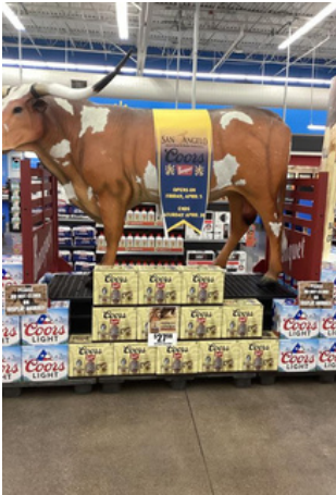
WALMART 0601 | SAN ANGELO