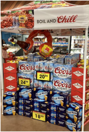
KROGER #534 | SHREVEPORT