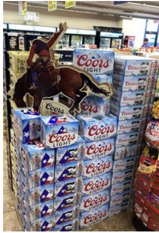
ALL SUP'S #102371 | SAN ANGELO