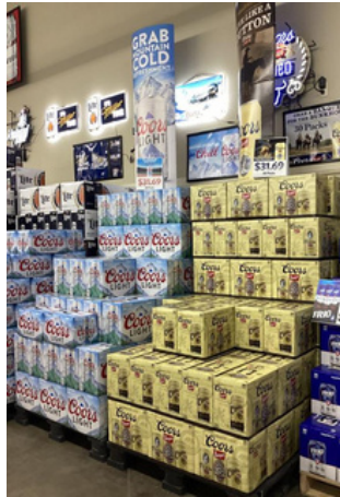
ARKA VALLEY LIQUOR | NORTH LITTLE ROCK