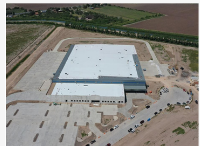
Weslaco Development: 09/20/23

The facility will boast a capacity of 1,000,000 CE's of inventory and will span 265,000 square feet on a 25-acre site. It will also incorporate cutting-edge technology and equipment, as well as 22 loading and unloading docks and a sheltered customer pick-up area. Moreover, the facility will have an 8,000 square foot keg cooler to store and distribute a wide range of keg products. Leadership anticipates employing over 220 people at this location.