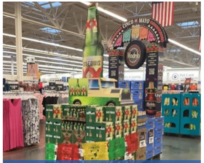
MARKET STREET #674 | ODESSA