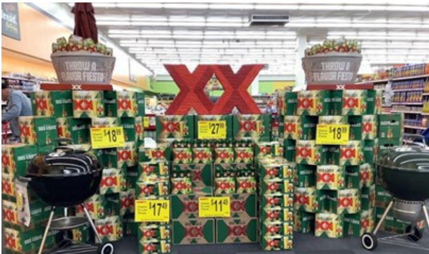
LOWE'S #37 | ODESSA