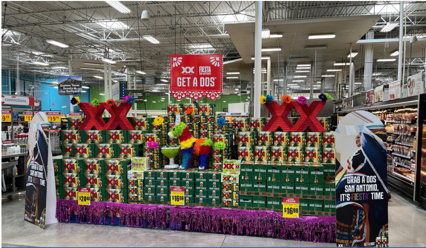
HEB #8 | SAN ANTONIO