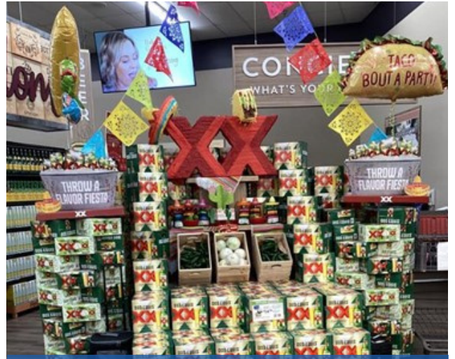
MARKET STREET #674 | ODESSA