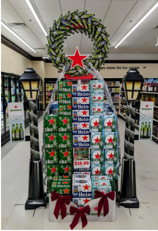
MALVERN FOOD CENTER | NORTH LITTLE ROCK