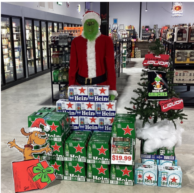
DAMASCUS LIQUOR | NORTH LITTLE ROCK