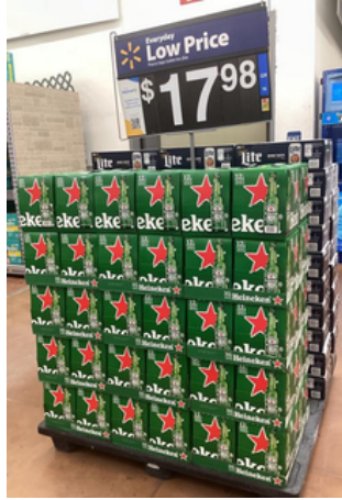
WALMART 5245 | SAN ANTONIO