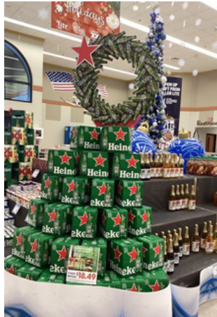
AAFES RAFB | SAN ANTONIO