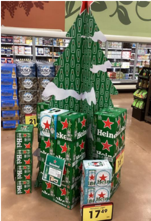
BAKERS 315 | OMAHA