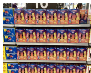
WALMART | MCALEN