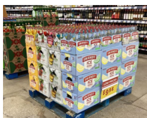
HEB | SAN ANTONIO