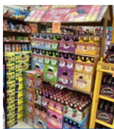
SUPER MERCADO | ODESSA