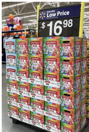
WALMART | MCALEN