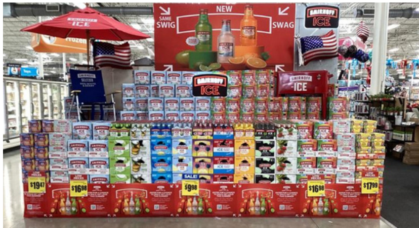
HEB | SAN ANTONIO