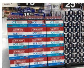
WALMART | WACO