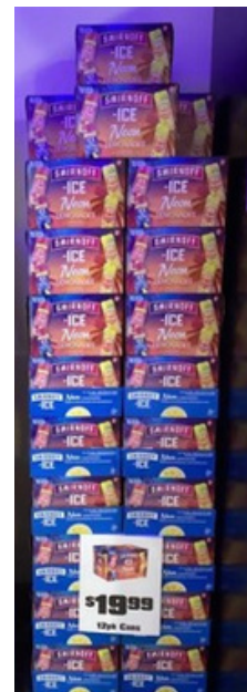
SPEEDY STOP 22 | VICTORIA