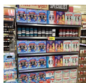
HEB | SAN ANTONIO