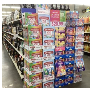
NORTH LITTLE ROCK