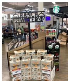
MARKET STREET | SAN ANGELO