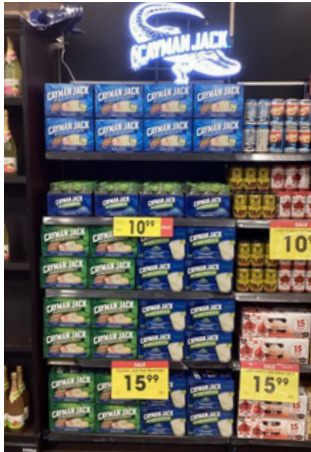
KROGER #629 | NORTH LITTLE ROCK