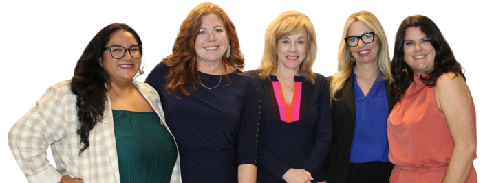
Sip N' Chat - Women's History Month: 03/27/24

Leadership guidance is invaluable, especially for those stepping into supervisory roles. Panelists emphasized the importance of skills such as active listening, ongoing education, and the ability to adapt to changing circumstances. These principles provide a roadmap for emerging women in leadership. The mentor-mentee relationship is highlighted as a cornerstone for growth, offering skill enhancement, learning from seasoned professionals, and opening doors to advancement opportunities.