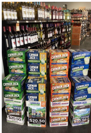
BILO'S LIQUOR | NORTH LITTLE ROCK