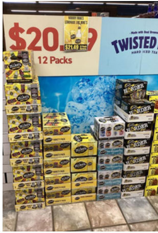
BLACKWELL LIQUOR STORE | NORTH LITTLE ROCK