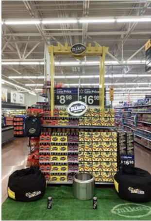
WALMART 1041 | WESLACO