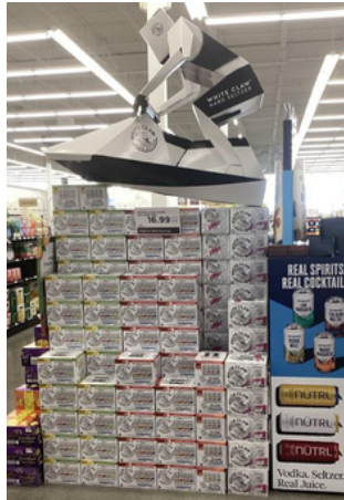
WALL TO WALL (PAPILLION) | OMAHA