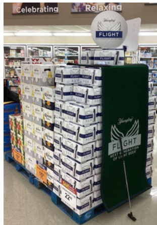
ALBERTSON'S 676 | ODESSA