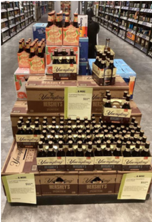
TOTAL WINE 532 | EL PASO