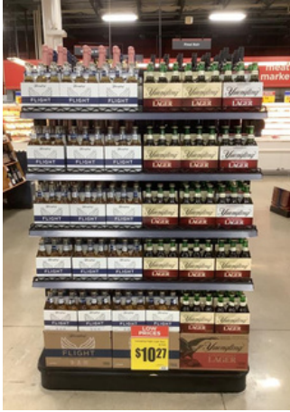
HEB FOOD 555 | SAN ANTONIO