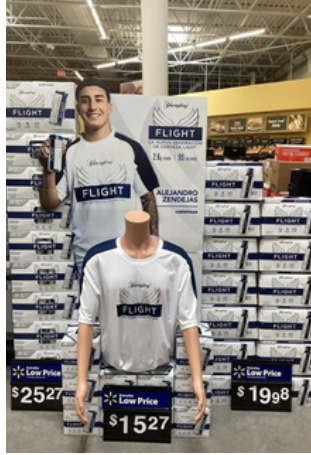
WALMART 5809 | WESLACO