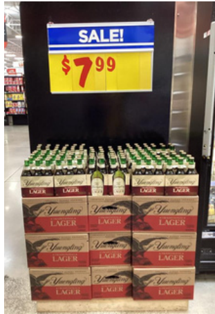
HEB FOOD 618 | SAN ANTONIO