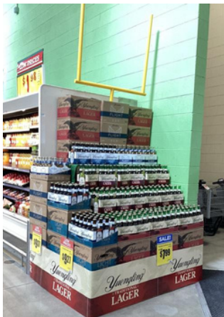
HEB FOOD 622 | SAN ANTONIO