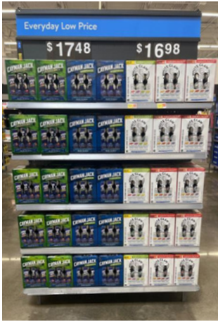
WALMART 002 | MOUNTAIN HOME