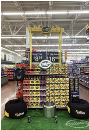
WALMART 1041 | WESLACO