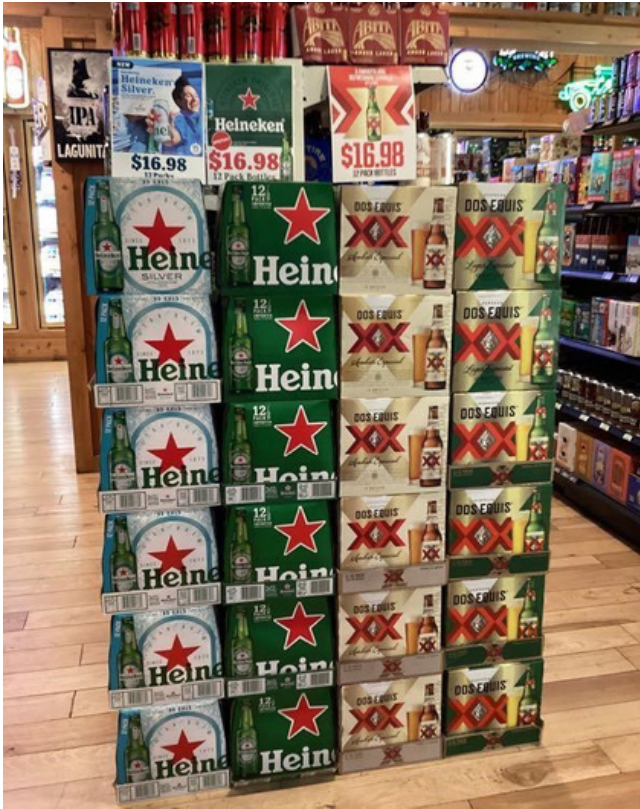
GUESS WHO | NORTH LITTLE ROCK