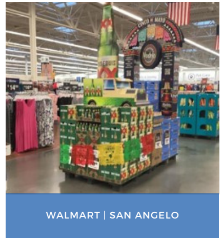
WALMART | SAN ANGELO