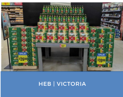
HEB | VICTORIA