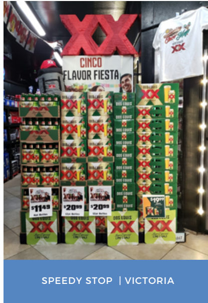
SPEEDY STOP | VICTORIA