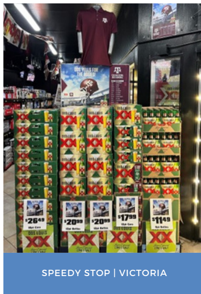
SPEEDY STOP | VICTORIA