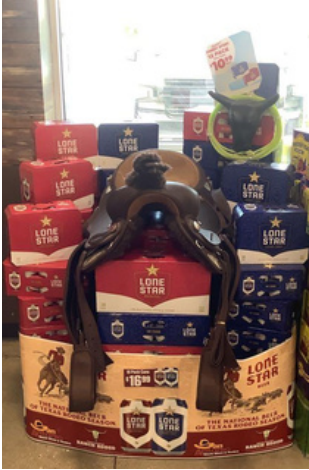
CIRCLE K #2741838 | SAN ANTONIO