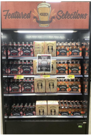
HEB FOOD 463 | SAN ANTONIO