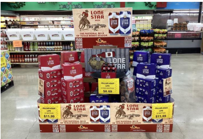
LA FIESTA #3 | SAN ANTONIO