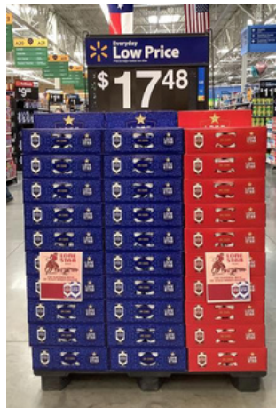
WALMART 3057 | SAN ANTONIO