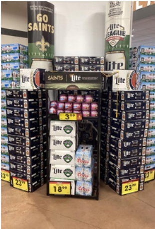
KROGER 534 | SHREVEPORT