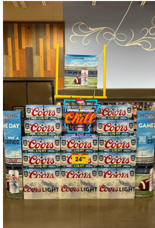
KROGER 629 | LITTLE ROCK