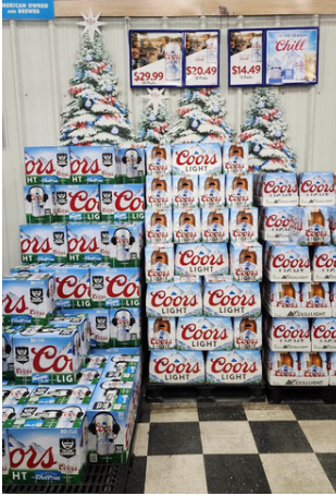
MALVERN FOOD CENTER | LITTLE ROCK