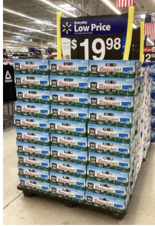
WALMART 0757 | SAN ANTONIO