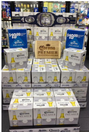
STRIPES 40724 | MCALLEN