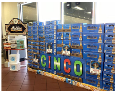
STRIPES 5093 | WACO