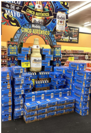
LOWE'S MARKETPLACE #37 | ODESSA