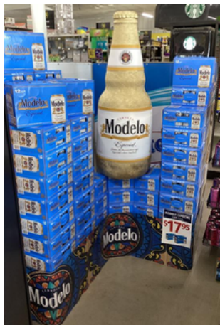
DOLLAR GENERAL #19045 | MIDLAND