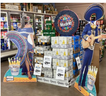
BORDER TOWN FOODS #1 | MCALLEN