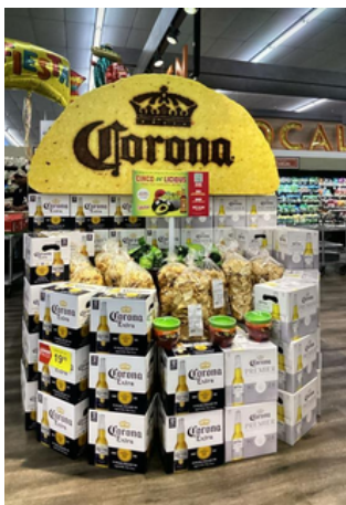
MARKET STREET #674 | MIDLAND