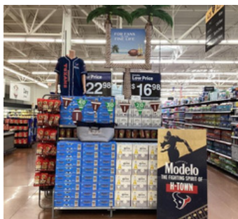
WALMART 1041 | MCALLEN