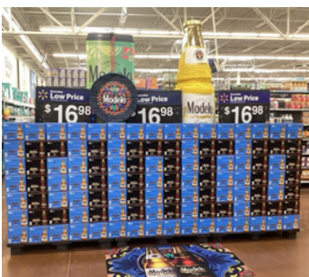
WALMART 1041 | MCALLEN