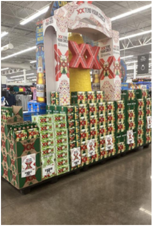
WALAMRT 0601 | SAN ANGELO