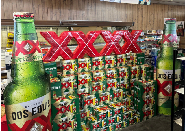
ARDS COUNTRY STORE | ODESSA