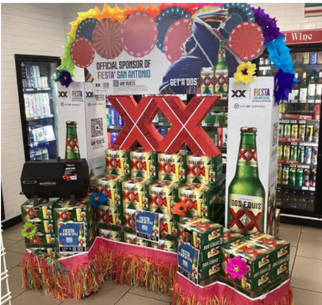
7 ELEVEN 38081A | SAN ANTONIO