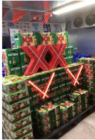
WHITS GROCERY | ODESSA