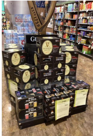
TOTAL WINE #504 | SAN ANTONIO