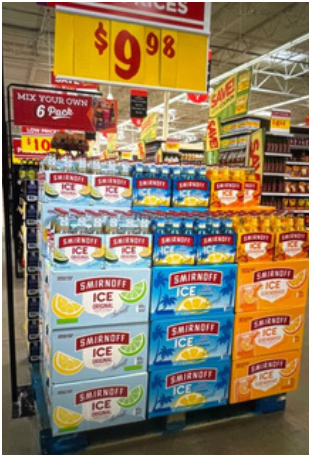
HEB FOOD #085 | SAN ANTONIO