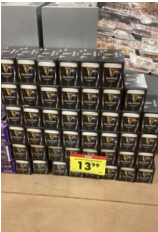
KROGER #652 | NORTH LITTLE ROCK