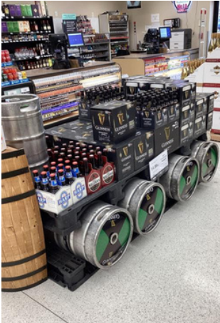
HY-VEE #1610 | SIOUX CITY