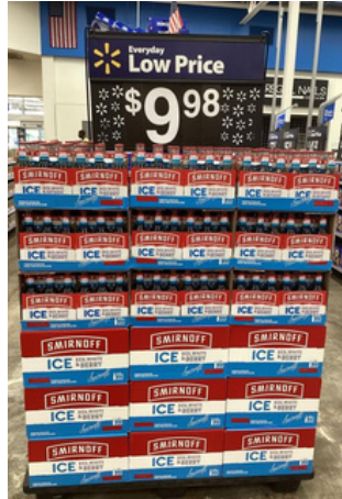
WALMART 0278 | SHREVEPORT