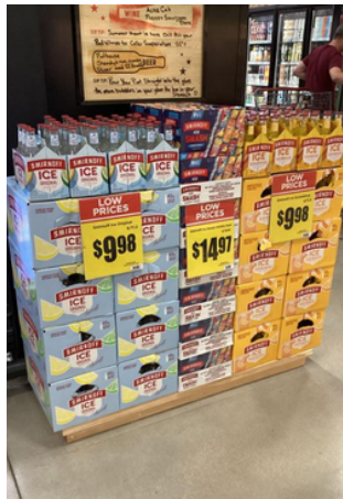
HEB #623 | SAN ANTONIO